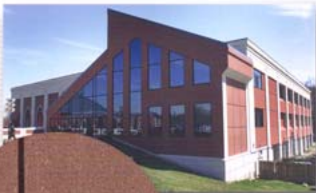
CHURCH HALL Davidsonville, Maryland

* As tested by the Oak Ridge National Laboratory. You can find a full copy of this report on our website: www.dryvit.com