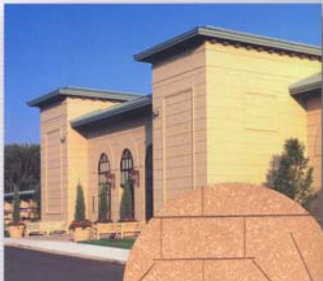
PALAZZO di BOCCE Orion, Michigan

Put simply, TerraNeo looks a lot like granite. Unlike granite, however, TerraNeo comes without the weight, cost and extensive lead time. When used as a finish for a Dryvit exterior insulation and finish system, it's part of a cladding that can be up to 84% more energy efficient than 6 other commonly used wall systems*.