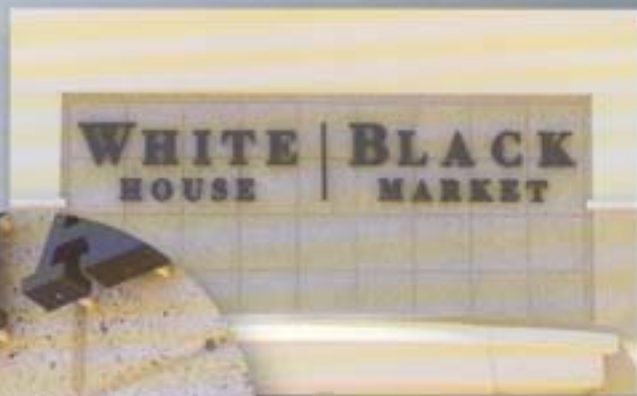
SHOPPES AT BELLEMEAD Shreveport, Louisiana