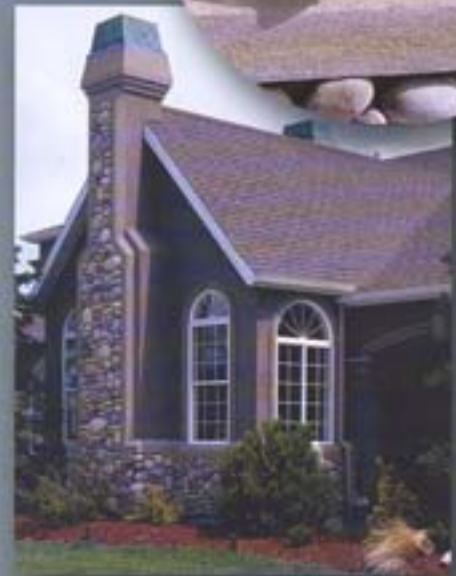
PRIVATE RESIDENCE South Jordan, Utah