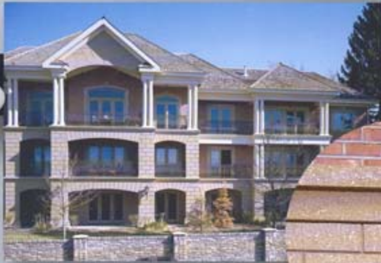
COUNTRY CLUB VILLAS Provo, Utah